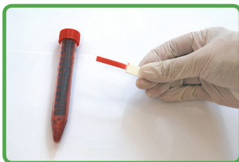
Let blood soak into paper strip