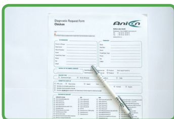
Fill out Diagnostic Request Form