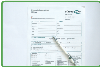
Fill out Diagnostic Request Form